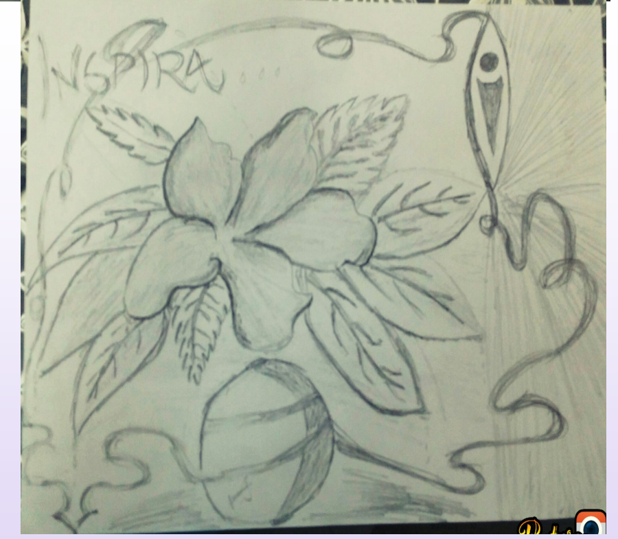
New Millennium School DPS: E-magazine: November Edition (2016)